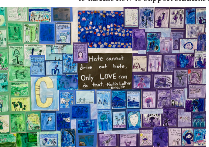
Lower School students created monochromatic self-portraits demonstrating one of the four Collegiate Cornerstones - Respect, Honor, Compassion, and Responsibility.

As a school, we use our programming and activities to broadly honor cultural diversity during Spanish History Month, LBGTQ History Month, Pride Month, Black History Month, and Women's History Month. We also recognize our cultural diversity during International Week as well as through our mission to develop students' global citizenship by studying multiple perspectives and increasing a sense of responsibility to live, work, and engage respectfully with a diversity of people in an interconnected world. Additionally, we value our alumni's voices and perspectives by utilizing those connections to discuss how to support students now, informed by