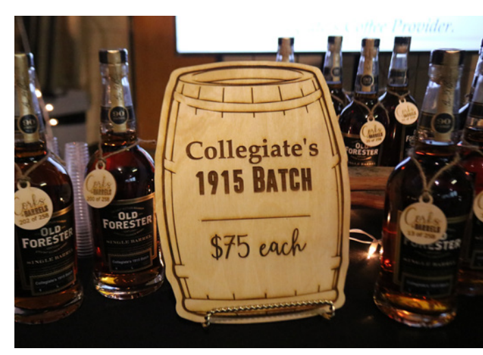
A huge thank you to Collegiate's Makery for printing all of our signage at Corks and Barrels!

Thank you for your support of the 2020 Corks and Barrels event!