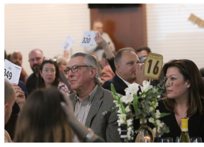
Attendees raised their paddles for scholarship endowment and donated $35,475 to support Collegiate families.

Total Expenses $50,182.03 Net for Endowment $35,475.00 Net for Operating $87,207.01