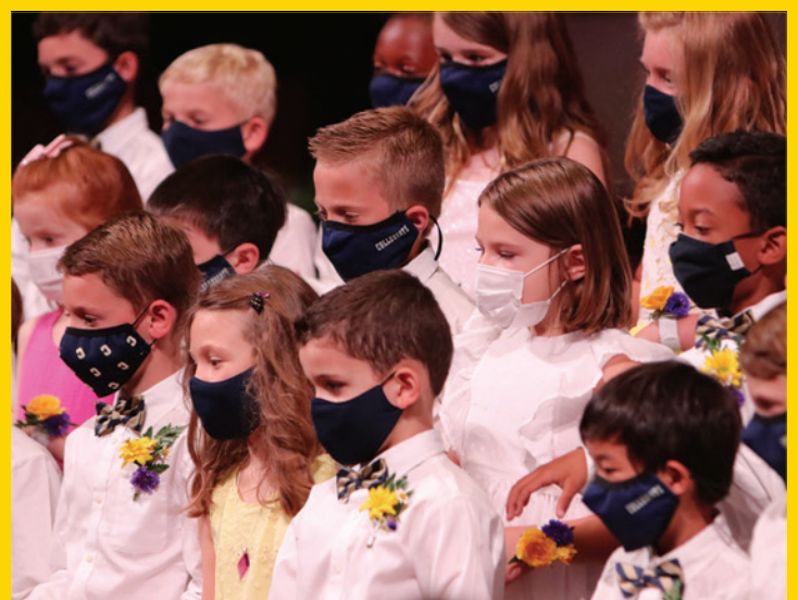
First-Grade students signing to their senior buddies at Graduation.