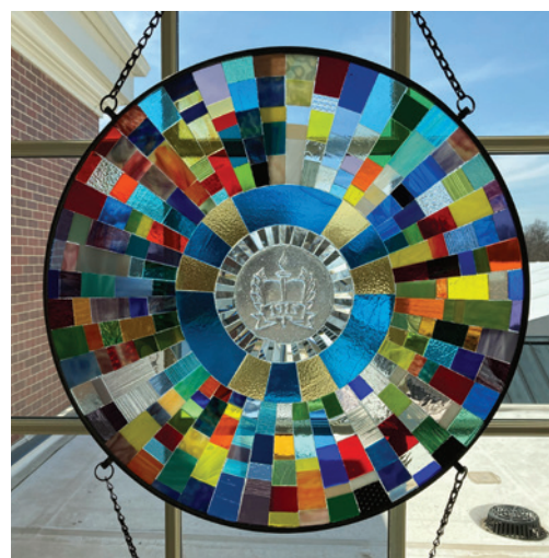
Special thanks to Hyland Glass for working with students to create this stained glass piece.

Nevertheless, despite these challenges, we enjoyed a ton of success at Louisville Collegiate School this school year. We still had Lower School field day, 39 Biography Projects in third grade, the Super Bowl of Reading in second grade, and a marvelous Lower School Art Show.