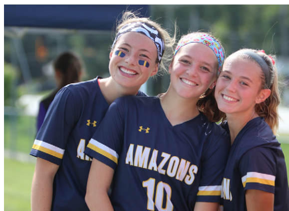
Varsity Amazons Soccer finished the season with a 12-3 record.