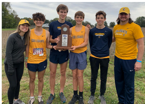
Varsity Titans Cross Country team finishes runner-up at regionals.