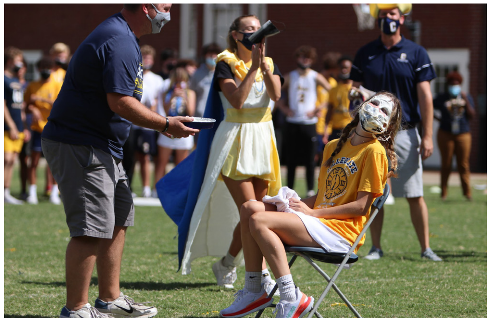
Students, faculty, and staff were excited to gather this year on the field for the fall pep rally!