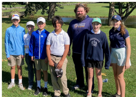
Middle School Gold Golf team finishes second in the JCPS Cup.