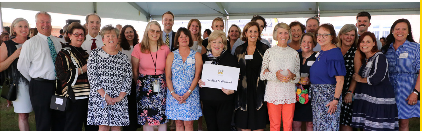
Thank you to our beloved faculty and staff, both past and present for supporting our honorees!