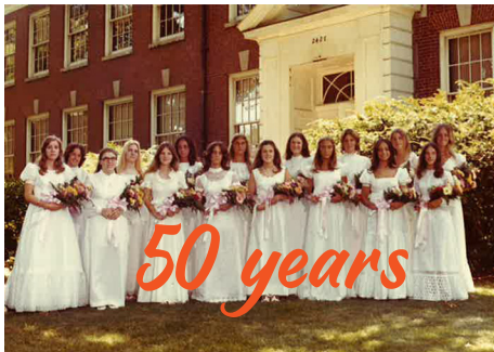
Class of 1972