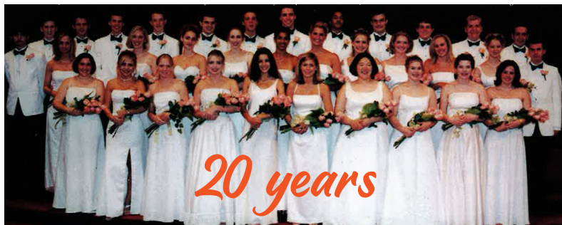
Class of 2002