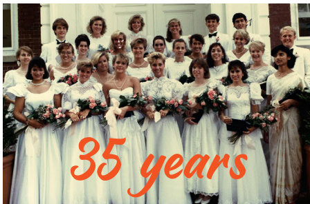
Class of 1987