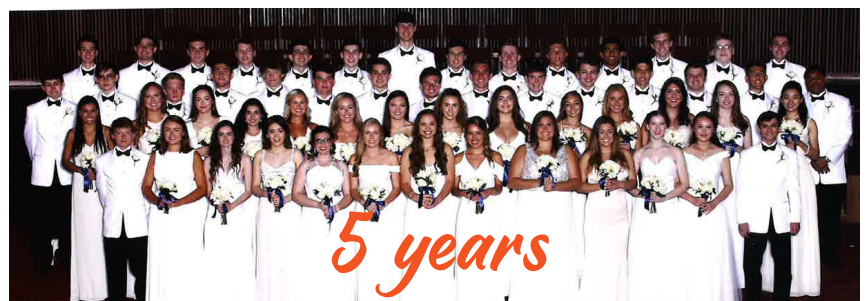
Class of 2017