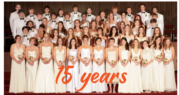
Class of 2007