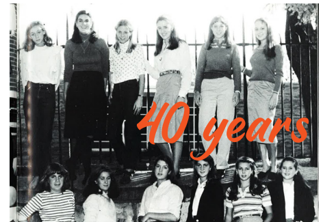
Class of 1982