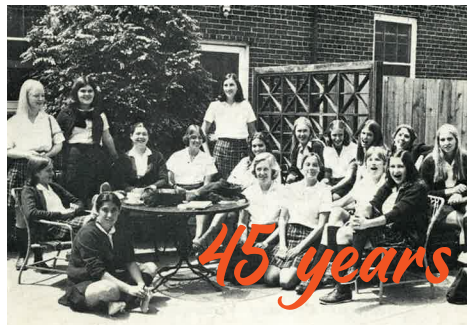
Class of 1977