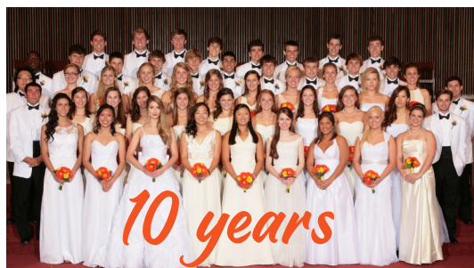
Class of 2012