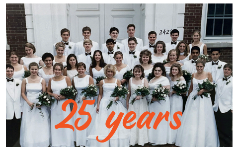
Class of 1997