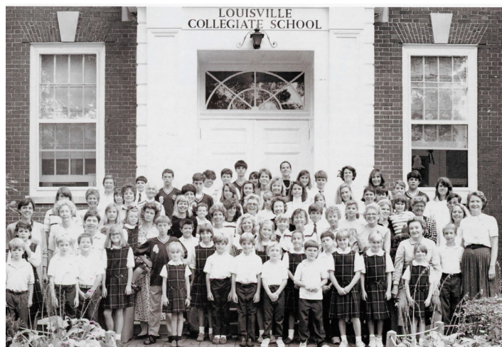
1990 Alumni Connection Photo