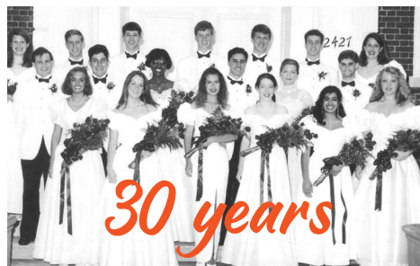
Class of 1992