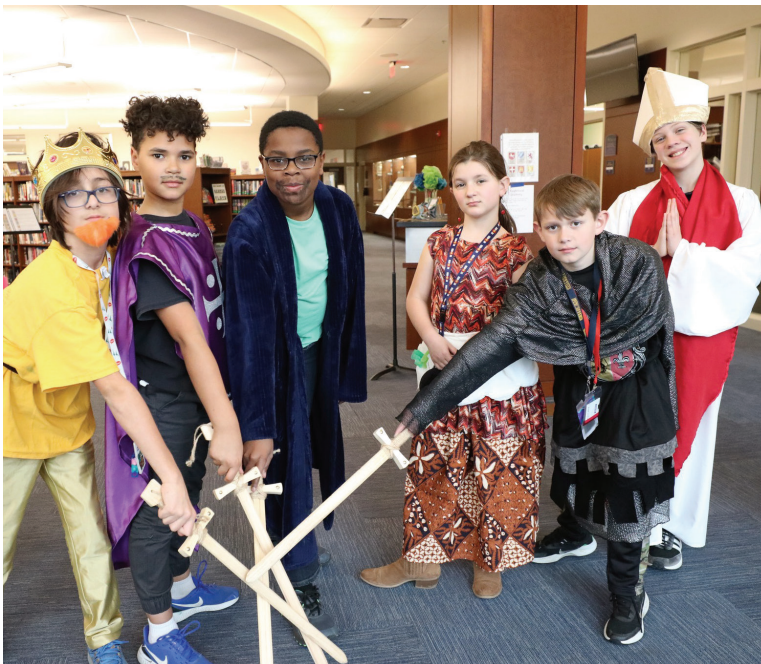
Fifth-grade students dress in costume and participate in various, hands-on activities throughout the day during the Medieval Fair.