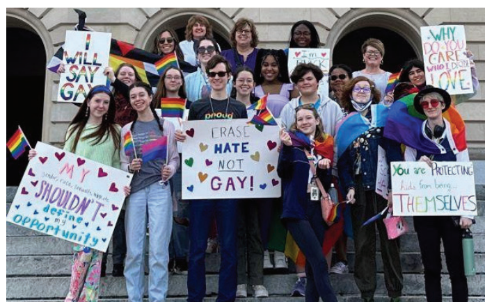
Students attended the Fairness Rally in Frankfort to protest the recent legislation targeting the LGBTQ+ community in Kentucky.