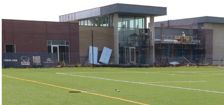
View from the Turf Field