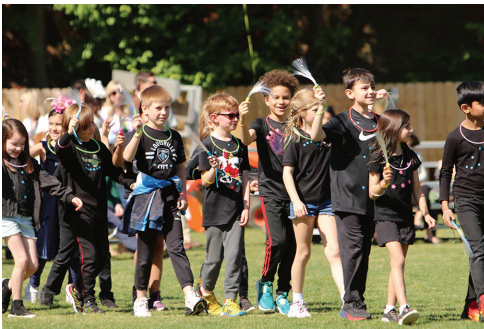
Lower School students participate in a "Pegasus Parade" around the track.