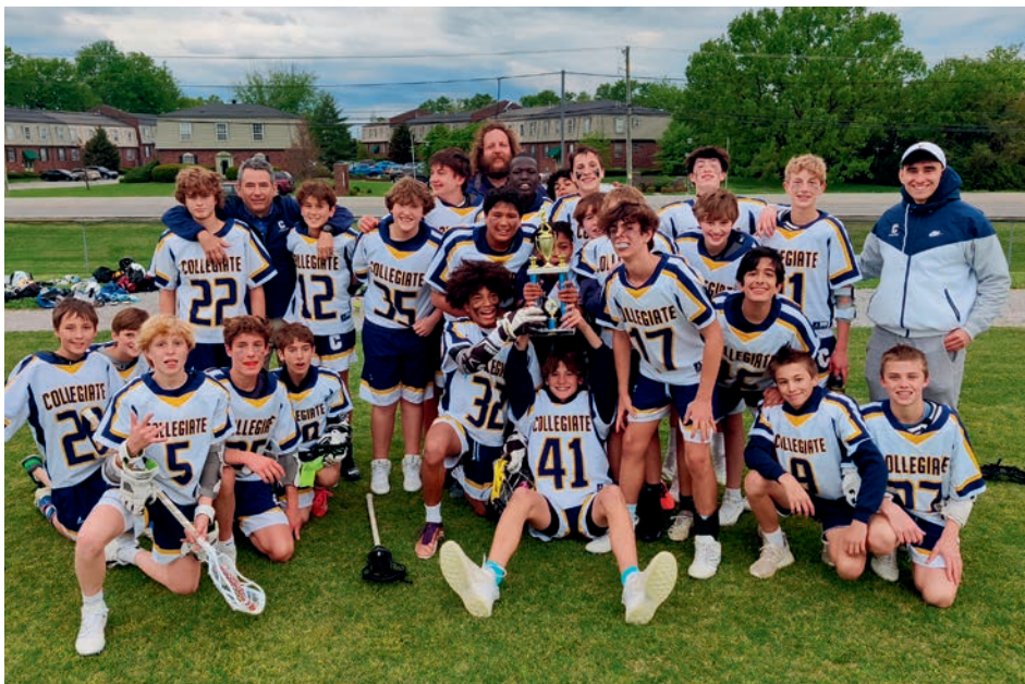
The Middle School 7/8 Lacrosse team finished the season undefeated and tournament champs!