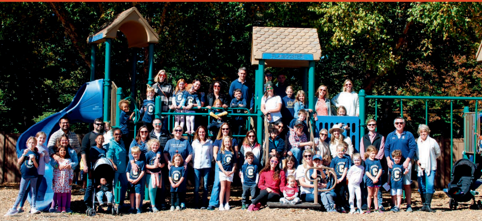
Alumni gathered with their children who attend Collegiate at the 2022 Fall Festival.