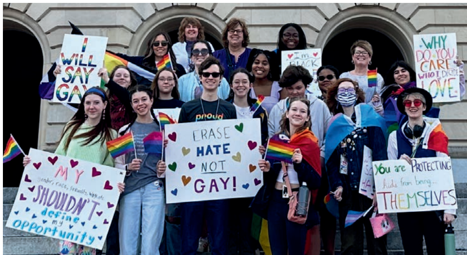
Upper School students attend the Kentucky Fairness Rally 2023 in Frankfort.