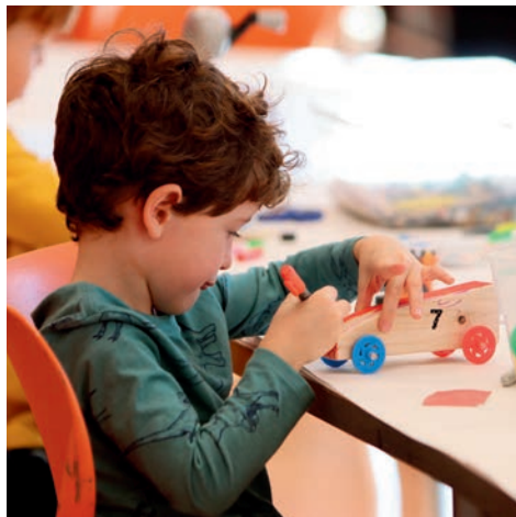
Junior Kindergarten students enjoy making Nerdy Derby cars in The Makery.