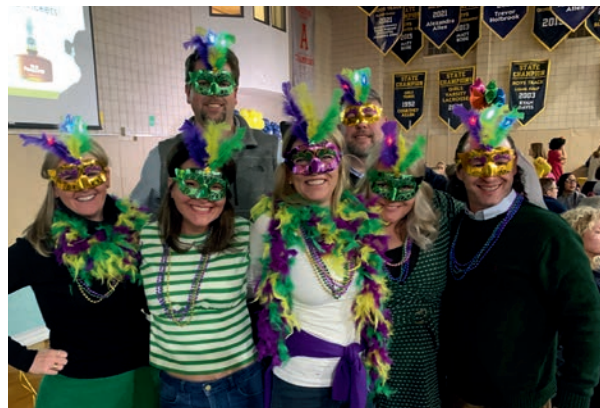
There were many incredible team themes and lots of school spirit on display at Trivia Night!