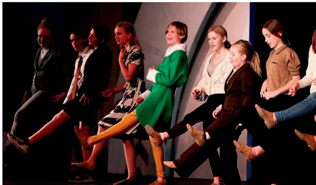
The Middle School students present the musical, "Elf, Jr."