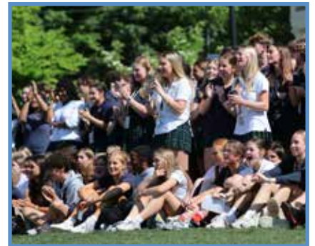
Upper School students cheering on their favorite kindergarten jockey.