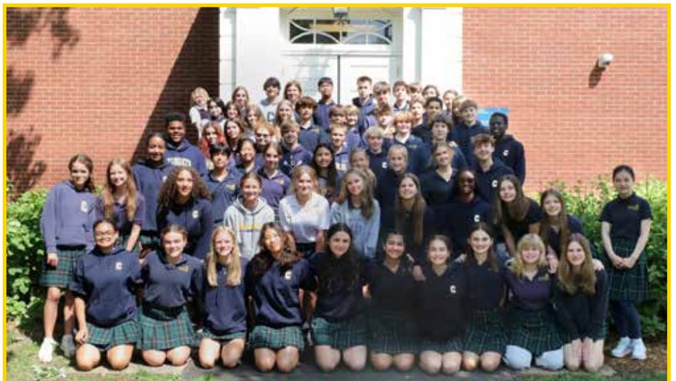
Congratulations to the Class of 2028! We are so proud of these eighth graders and are excited to see them in the Upper School in August.