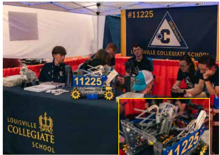
The DELTA Robotics team talks strategy at the FIRST World Championships.

In the Upper School, students can enroll in the Honors Robotics course, a science elective that focuses on participation in the FIRST Tech Challenge robotics competition. This project-based course is open to students in grades 9-12, and students can participate for multiple years to maintain their place on the Upper School robotics team.