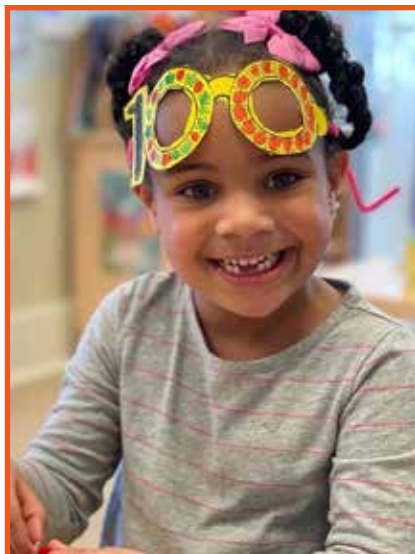
Lower School students loved celebrating the 100th Day of School on February 5!