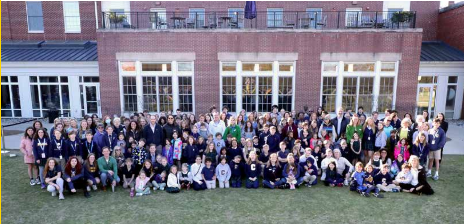
The Alumni Connection photo features current students whose parents, aunts, uncles, or grandparents attended Collegiate. Thank you to all of our alumni for coming to campus and joining us for the reception!