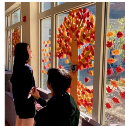
Students enjoyed reading the messages of gratitude for the LCS community.

In November, our Parents Association invited students to express their gratitude for Collegiate, resulting in a beautiful installation outside the Thornton Dining Commons. The leaves on this display, adorned with messages of thanks, highlighted the things our students hold dear—teachers, friends, lunches, the playground, and the support they receive at Collegiate. These expressions reflect our commitment to fostering a community where every student feels they belong.