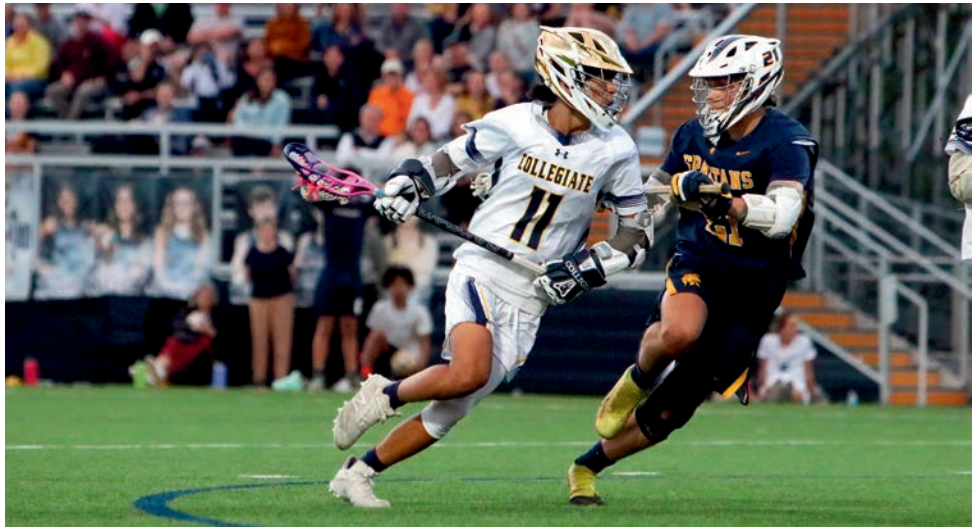
Upper School lacrosse team playing a game on the new multipurpose turf field.