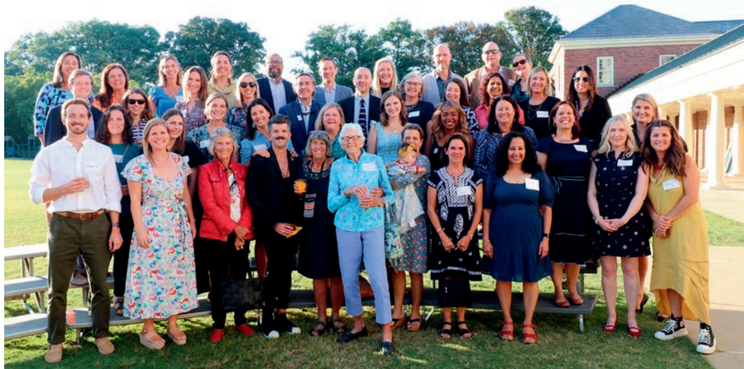
Alumni gathered for a photo at the 2023 Alumni Awards and Hall of Fame Induction Ceremony.