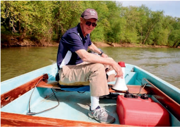
In memory of Sandy Taft designated to Collegiate's Crew Program.