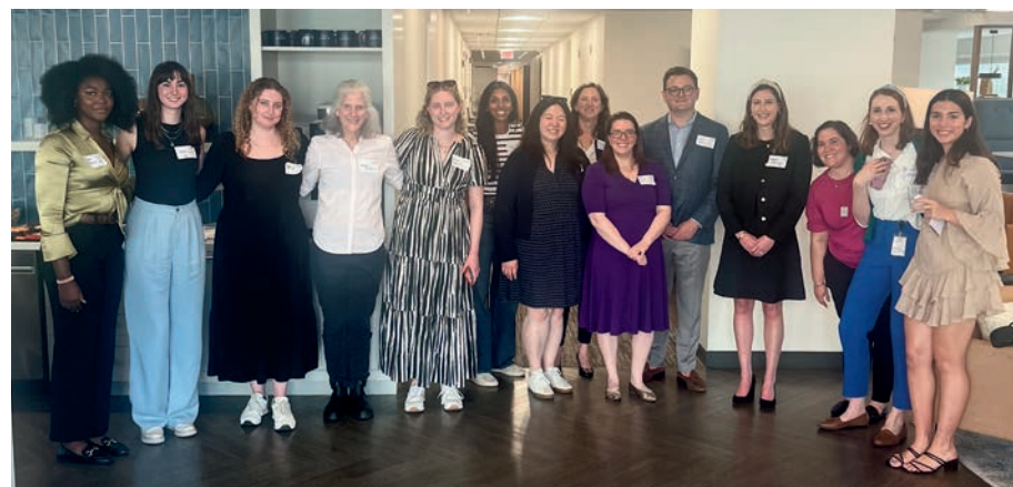
Local alumni gathered for a reunion in the Washington, D.C. area.