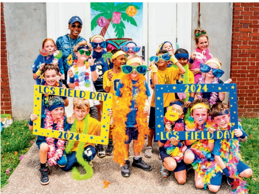
First-grade students enjoying Lower School Field Day.