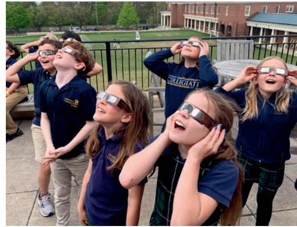
Fourth-grade students viewing the Solar Eclipse from the Terrace.