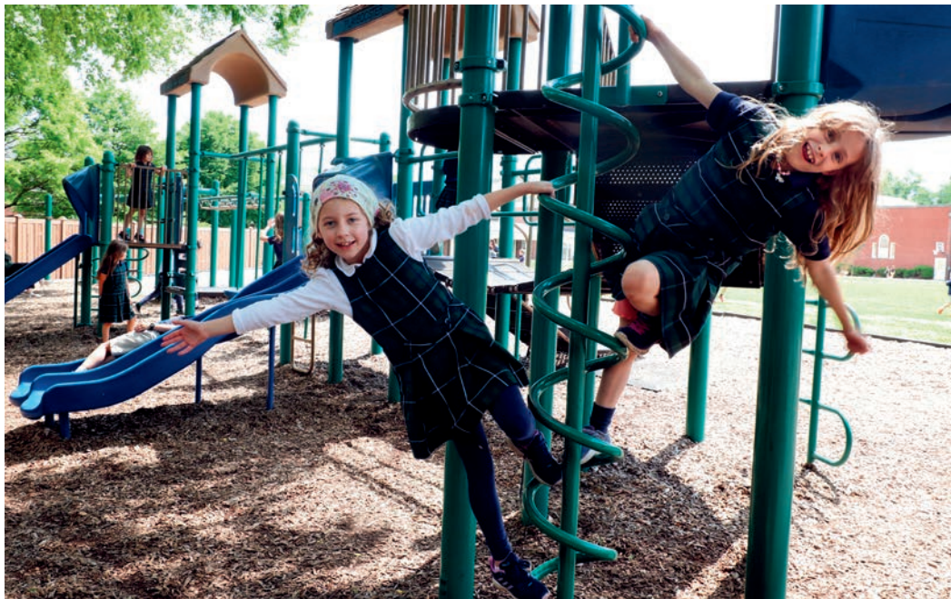
Lower School students enjoying the playground during recess.