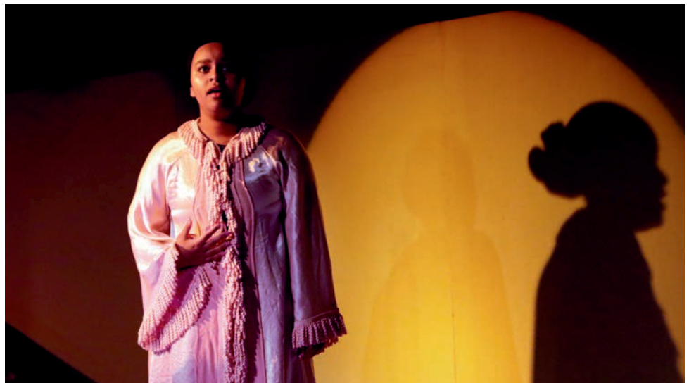
Upper School students presented "A Midsummer Night's Dream."