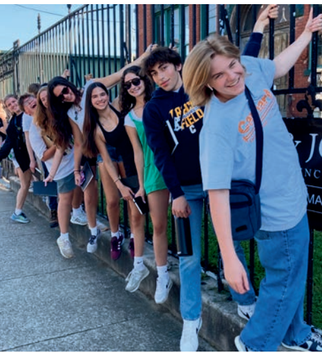
Upper School students enjoying May Term.

Gifts of $1,000+ help send students off campus for learning. From Kindergarten field trips to the wide variety of experiences in the Upper School's May Term, the ever-expanding list of experiential opportunities broaden our students' experience of the world and inspire a lifelong love of learning.