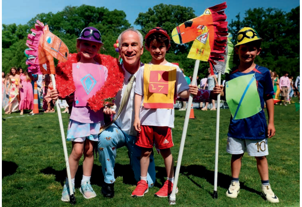
Kindergarten students ran in the 62nd Kindergarten Derby on May 2.