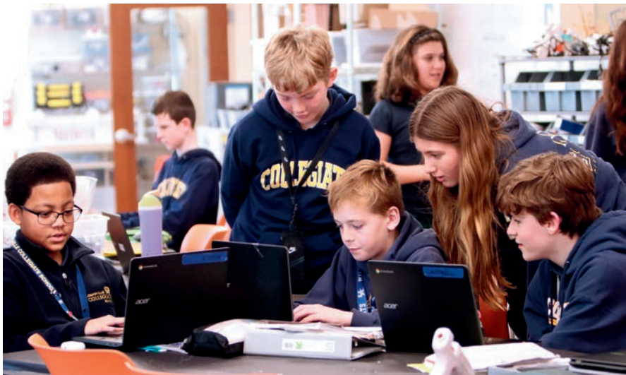
Middle School students working together in The Makery.