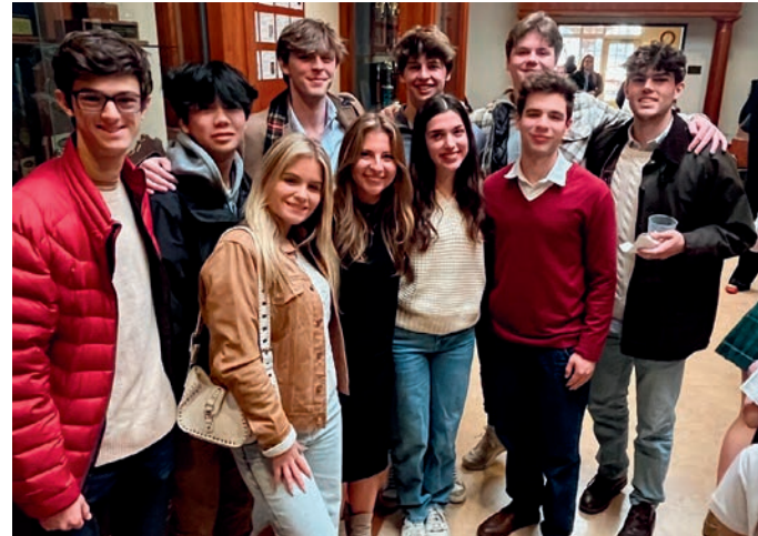
Alumni from the class of 2023 came back to Collegiate for Donuts and Dona Nobis.