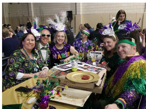
Collegiate parents dressed in Mardi Gras theme.