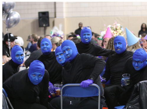
Blue Man Group competing at Trivia Night.