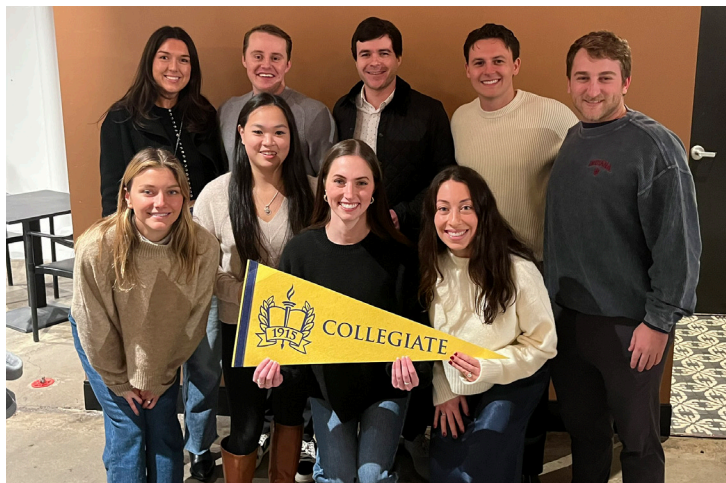
The class of 2014 held a reunion at Ten20 Craft Brewery.