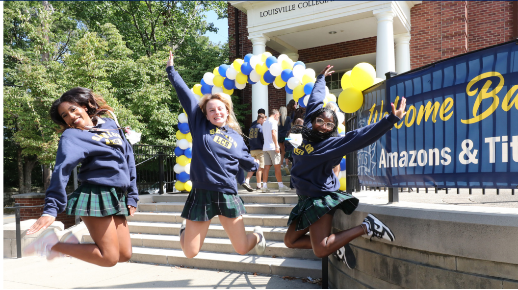
Upper School students jumped for joy to start the 2024-25 school year!