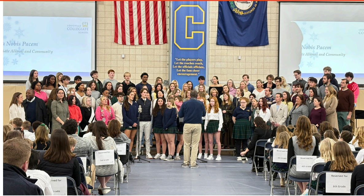
Alumni sang Dona Nobis Pacem at the 2024 Holiday Program.