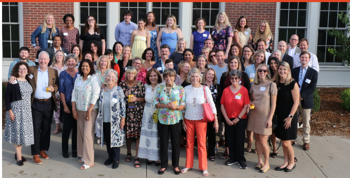
Alumni gathered for a photo at the 2024 Alumni and Faculty Celebration.