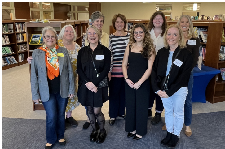
The class of 1984 participated in our first Women in History Oral History Drive.