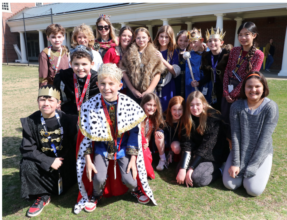
Fifth-grade students enjoyed dressing up and participating in the Medieval Faire.