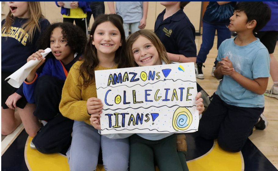
Lower School students were all smiles at the all-school Pep Rally!