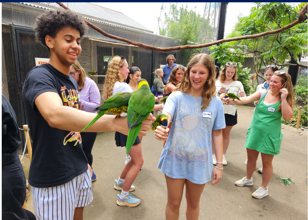
Upper School students enjoyed spending the day at the Louisville Zoo as part of their May Term experience.