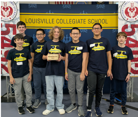
The Middle School robotics team, Yellow Submarine, competed at the FLL Tournament.

Louisville Collegiate School would like to thank the following community partners who have expressed their support for Collegiate's students, faculty/staff, programming, and mission.