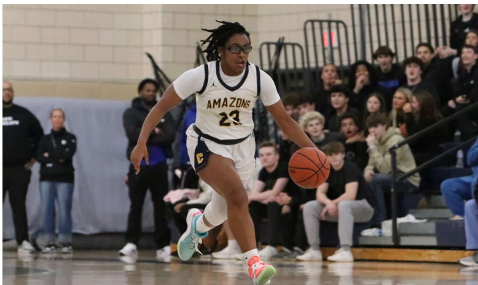
The Varsity Amazons Basketball team competed against KCD.