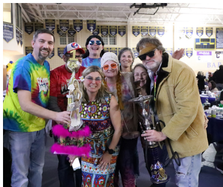
Congrats to our Trivia Night winners!