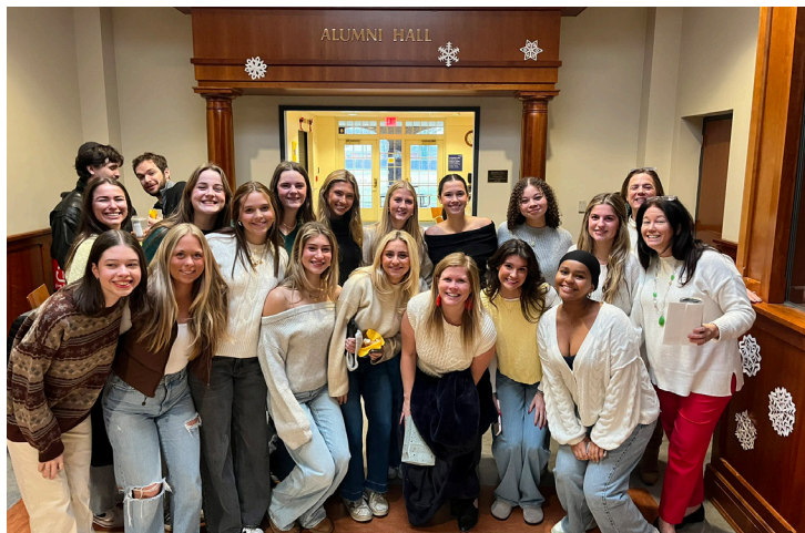
Alumni enjoyed reconnecting at the 2024 Holiday Program.