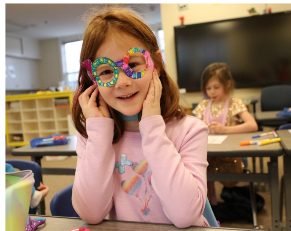
Students loved celebrating the 100th Day of School!