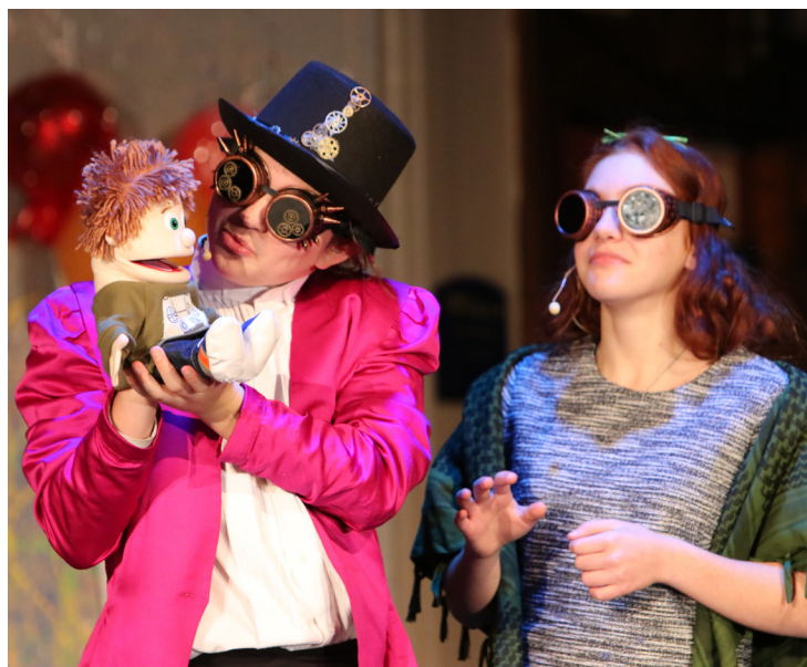
Middle School students presented "Willy Wonka, JR."